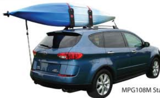
MPG108M Stax™ Kayak Carrier

MALONE AUTO RACKS, 81 County Road, Westbrook, Maine 04092